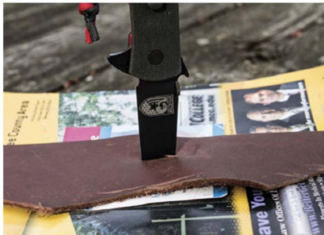
Middle: When stabbing into a phonebook and leather swatch, I pierced right through the phonebook and slightly into the table below.