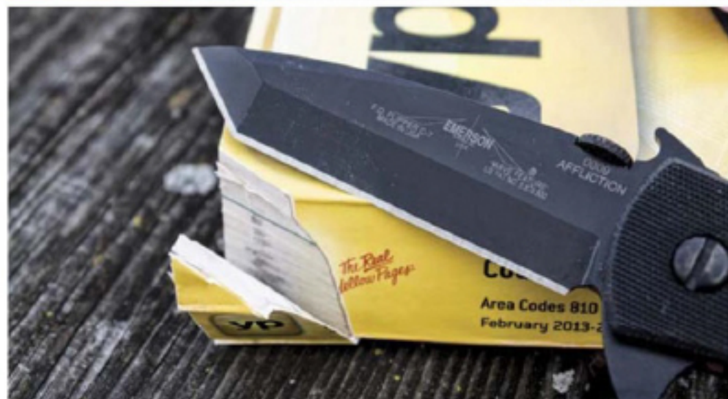
Bottom: I pressed the blade all the way through to cut off the entire corner of a phonebook at the spine side.

“... THE FLAT SIDE OF THE BLADE IS ADORNED WITH THE ‘AFFLICTION FREEDOM DEFENDER’ FOUNDATION CREST WITH EAGLE, STAR AND FLAG ELEMENTS. EVERY PART OF THIS PROJECT DISPLAYS ALL-AMERICAN PRIDE.”