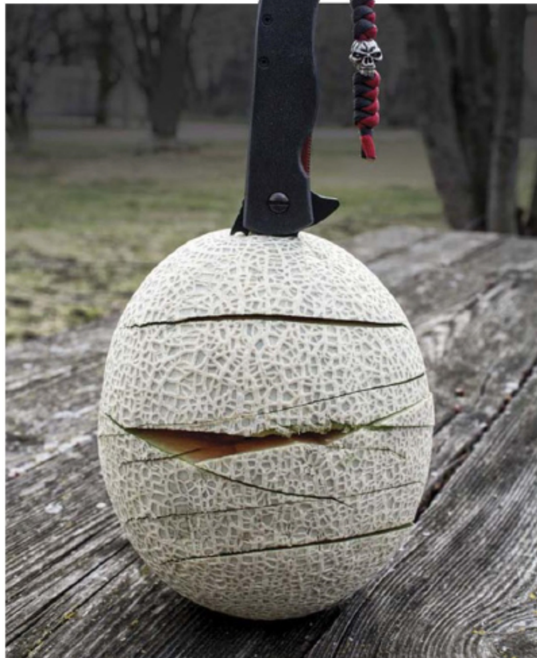
Top: During my testing, I got some very clean slashes on a cantaloupe without knocking it over.