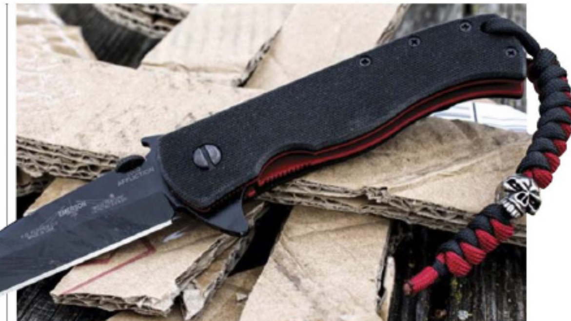
Using the tip, I sliced through two thick layers of cardboard (and even into the table) with no signs of wear on the blade.

piece of leather onto a phonebook, and with one stabbing motion, I was able to pierce cleanly all the way through the phonebook, with the tip protruding out the other side and a bit into my table. I believe that the Freedom Defender will have no issues with being able to penetrate any subject matter you may put before it.